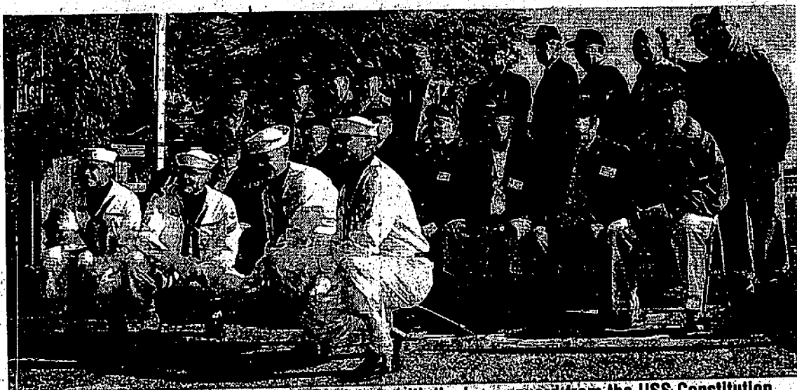
The crew of the USS Duxbury pose for a picture with the honor guard from the USS Constitution.